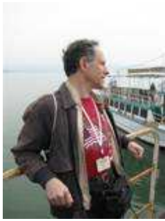
Kroy at the Sea of Galilee