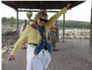
Wanda at Megiddo